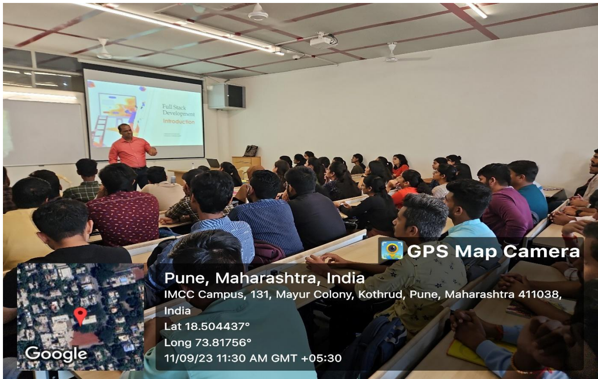
Faculty is delivering lecture using ICT Tools