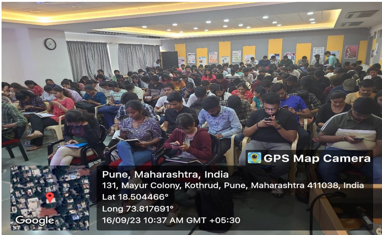
Students solving the assignment test using College ICT facilities