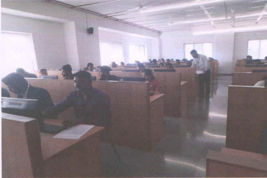
Session was conducted in Lab, institute have created separate slot for both Division