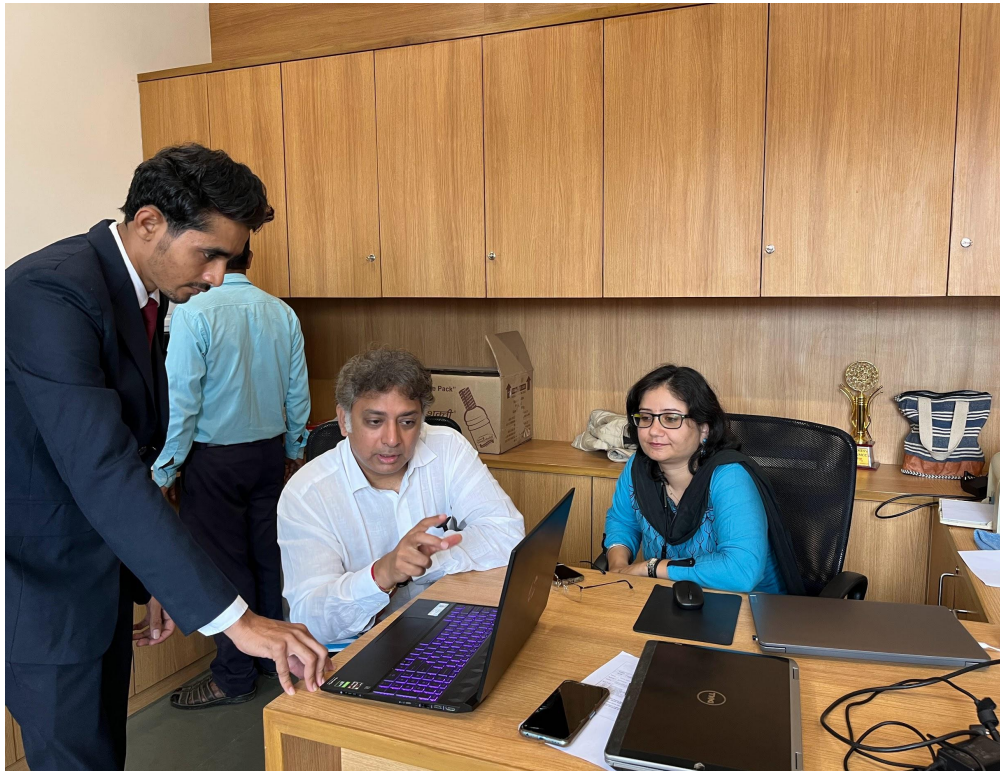
Project Guidance by Industry Experts