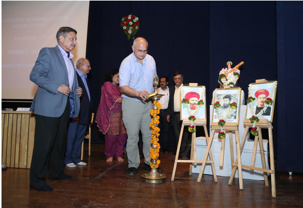
Illustrious panel of HR Meet