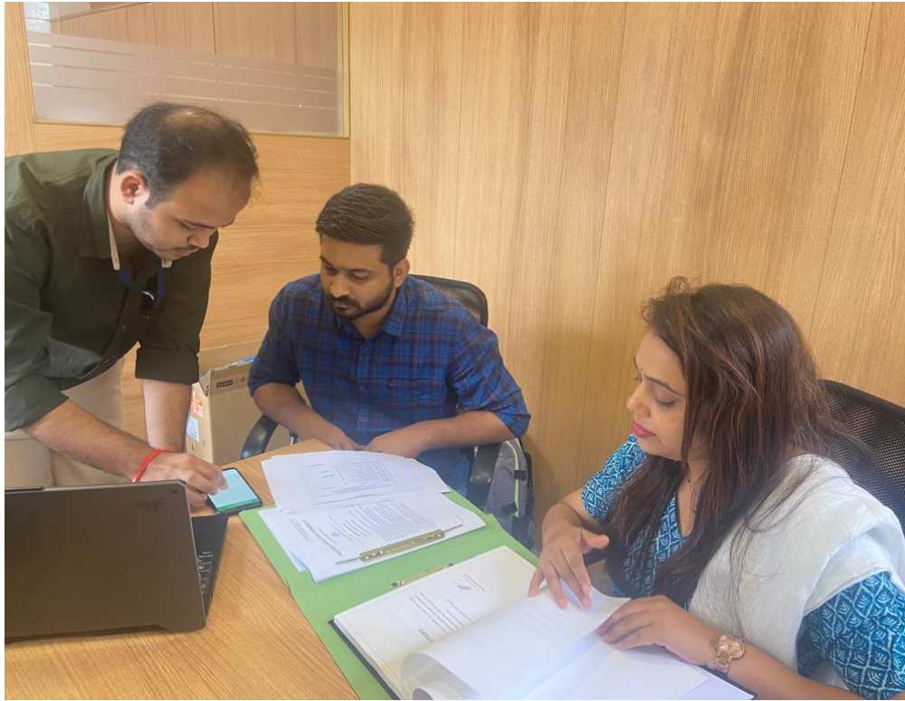
Project Guidance by Industry Experts