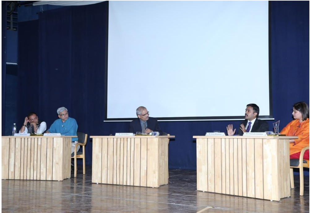
Brainstorming session during HR Meet