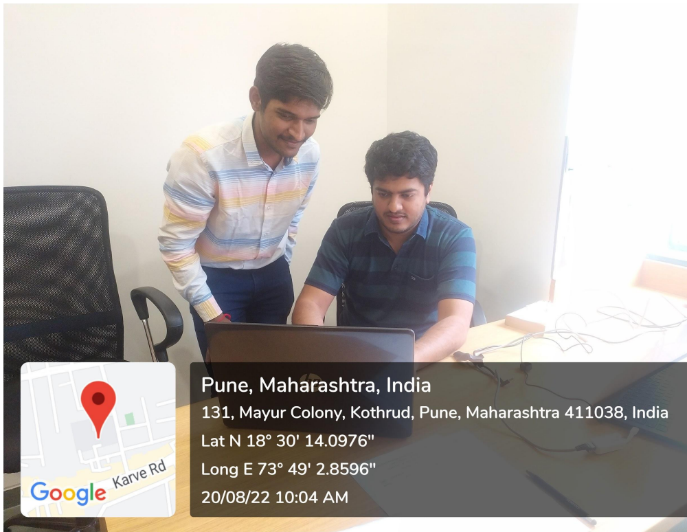
Project Guidance by Industry Experts