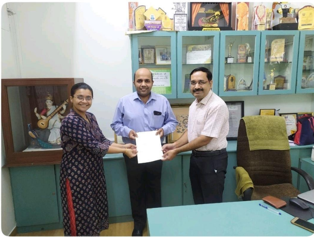
MoU signing with Soham Dadarkar Academy