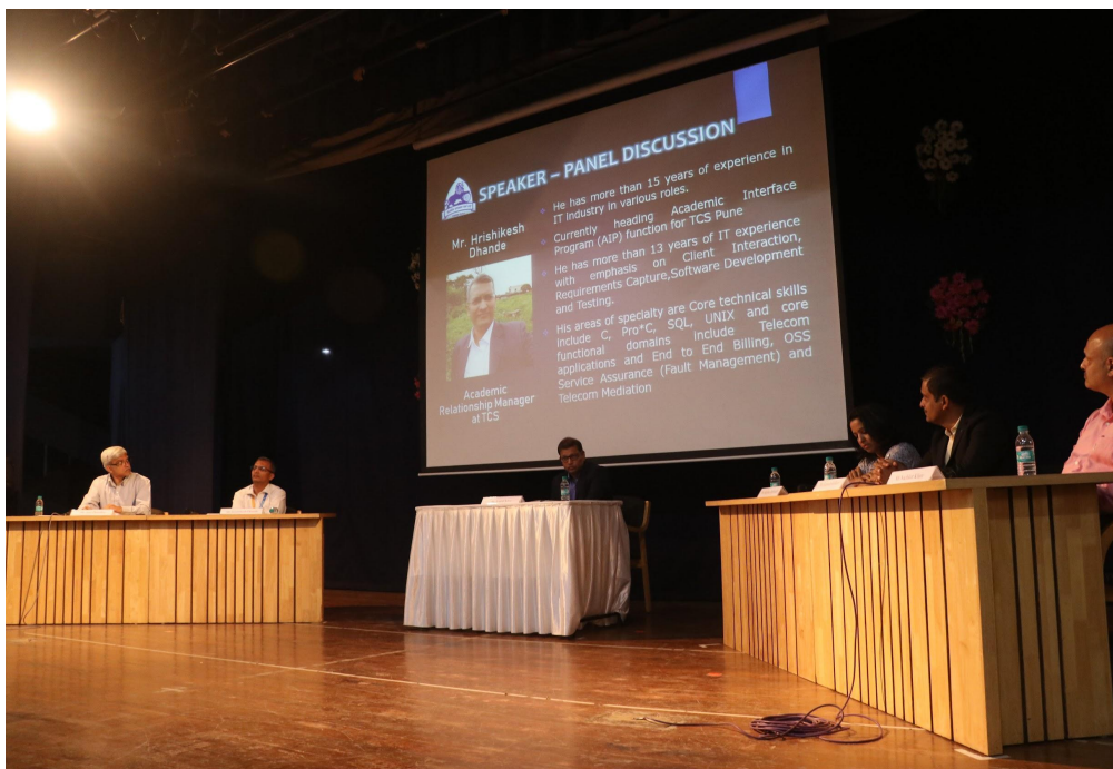
Illustrious panel of HR Meet