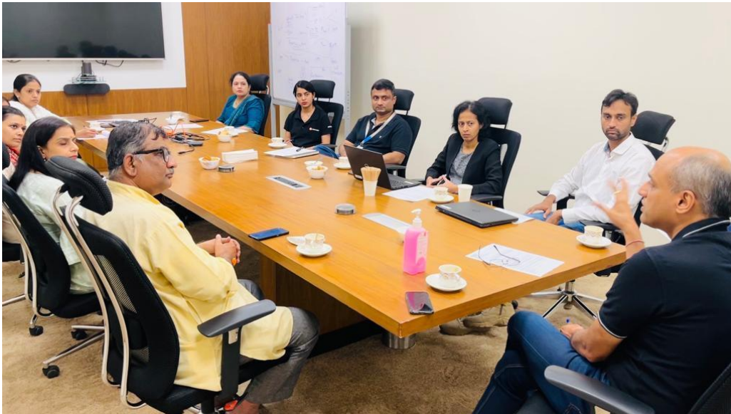
Course content discussion with Datametica