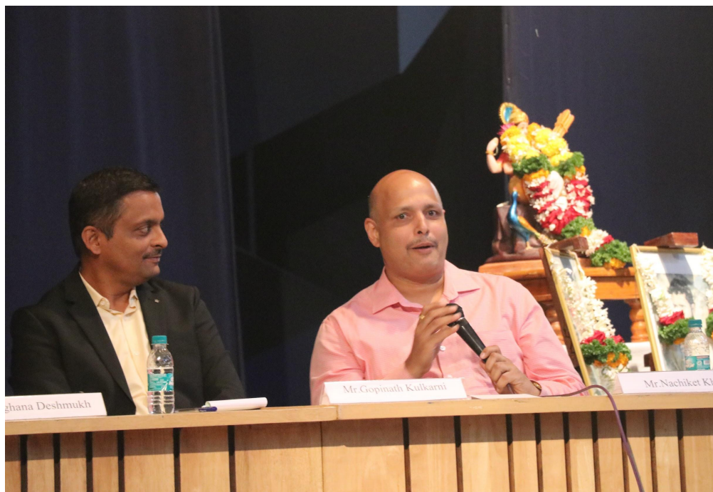
Industry experts interacting

The above means of interactions with the industry helps the Training and Placement department of the Institute in getting better and better placement opportunities for the students for each batch.