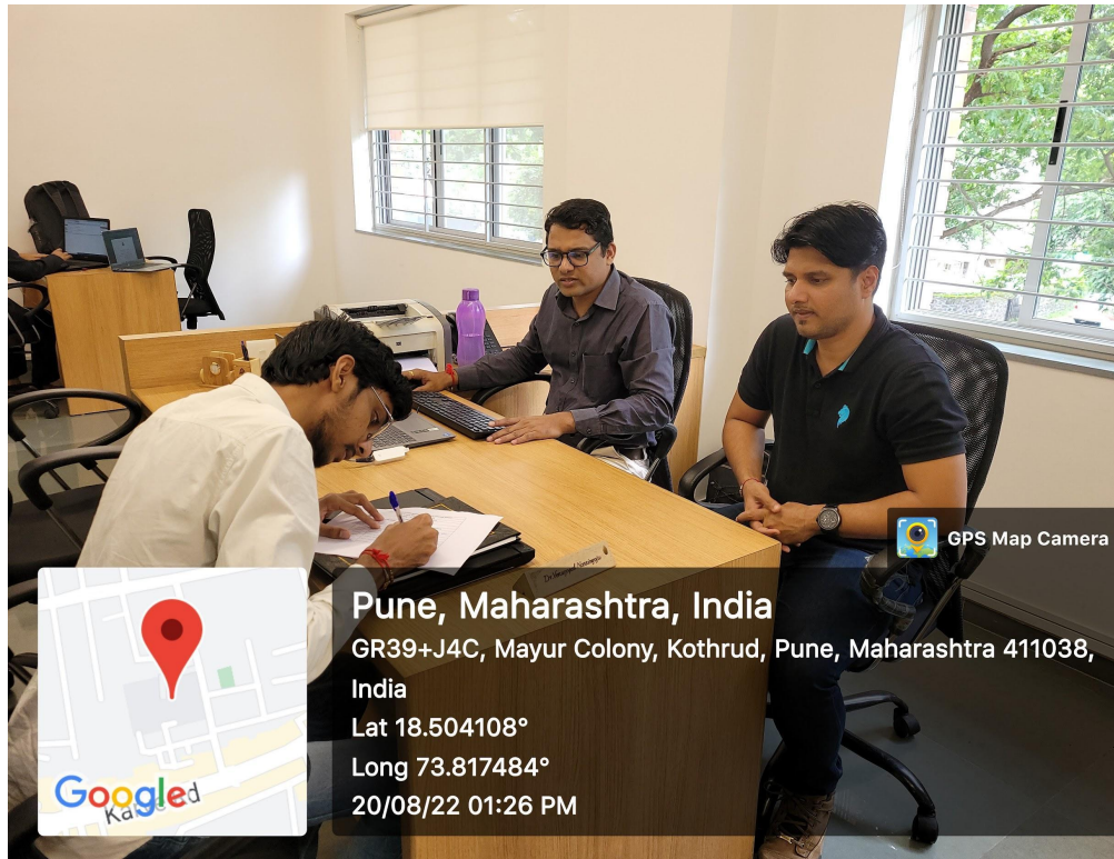
Project Guidance by Industry Experts