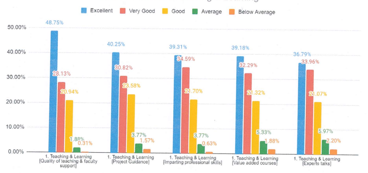
Teaching & Learning